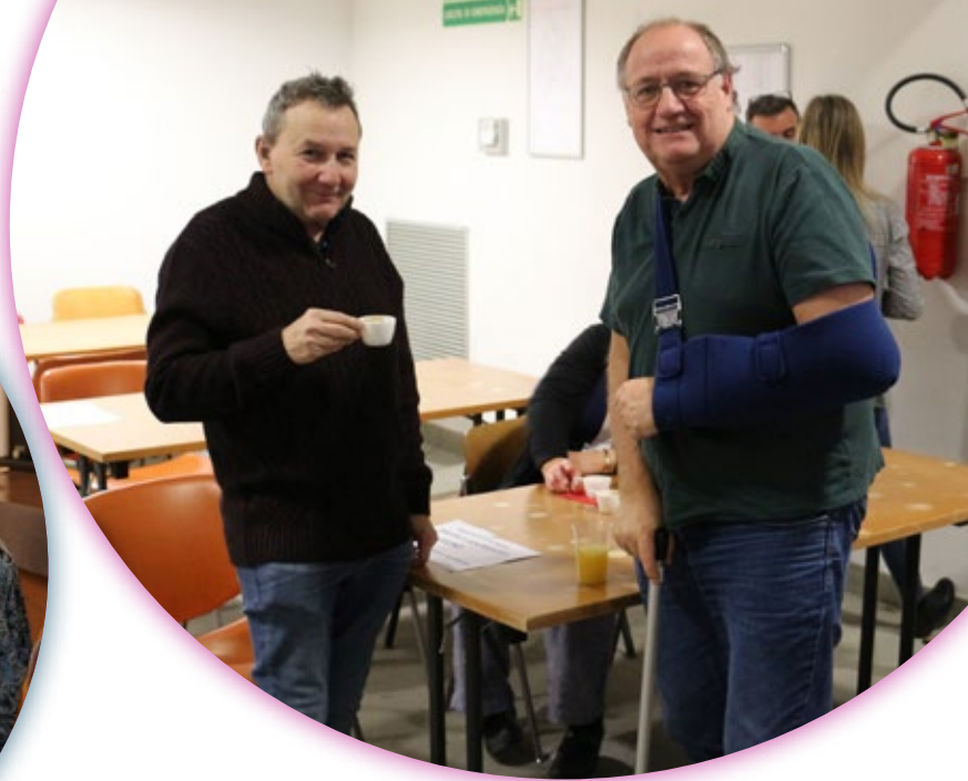
On the cover: The last meeting of the DevelopAKUre consortium in Siena, Italy, 2019